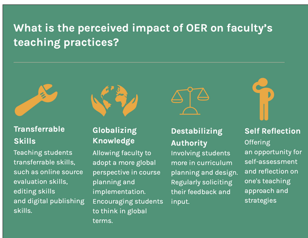
Figure 2 Themes that emerged as faculty described how OER is impacting their pedagogy.