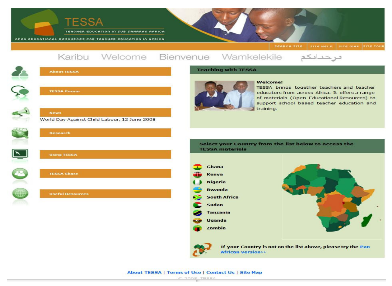
Figure 1: Screen capture of TESSA portal landing page in 2008

The TESSA (Teacher Education in Sub-Saharan Africa) Programme is an ongoing research and development programme that aims to sustain an Africa-wide consortium that aims to improve access to, and raise the quality of, all aspects of teacher education and training. The analysis covers the initial phase of the TESSA programme implementation that commenced in 2005 and ended in August 2008 which aimed to: create a bank of 'open content' multi-media resources in on-line and traditional text formats that will support school based education and training for teachers working in the primary education sector; develop 'open content' support resources for teacher educators and trainers who will be planning, implementing and evaluating the use of the resources developed above; effectively extend and widen the take-up and use of the TESSA resources and ideas across SSA; and implement research activities that would promote the improvement of teacher education generally, in particular school based teacher education in SSA. The programme was established as a result of more than ten years of co-operative partnerships undertaken through a variety of projects that were consolidated to form TESSA's founding consortium partner network of 16 institutions in 9 countries. By the end of the initial phase, over 100 academics and over 1,000 teachers had been involved in the design of the programme. The bank of open content resulting from all this activity was accessible through a portal (Figure 1).