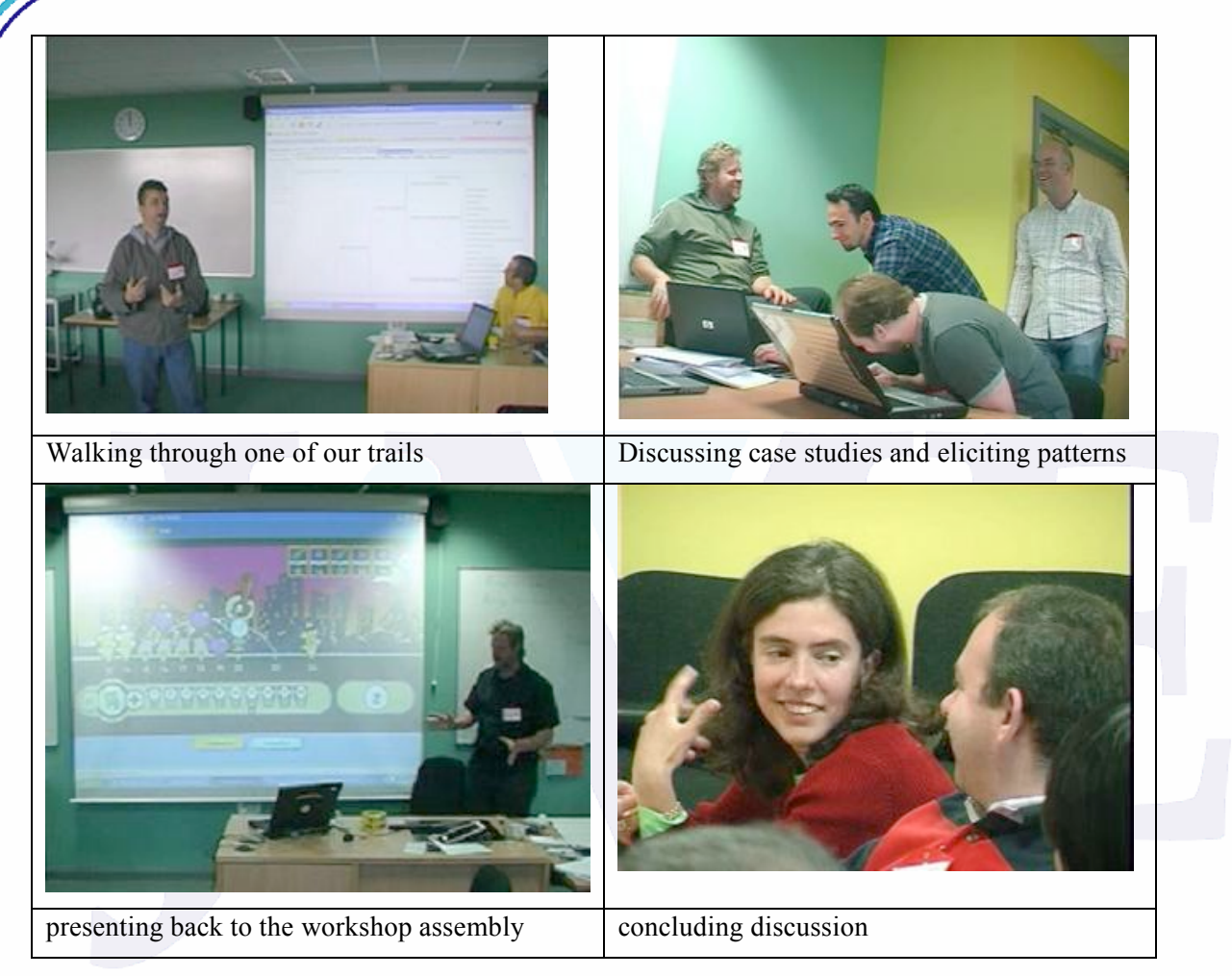
Figure 2: scenes from a workshop

Towards the end of the workshop, we would reassemble in full forum and each group would present its case study and derived patterns. Participants would then reflect on the process of pattern elicitation, its outcomes, and their relevance to their daily work.